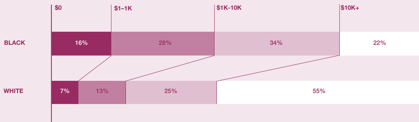
RAINY DAY SAVINGS BY RACE, 2021