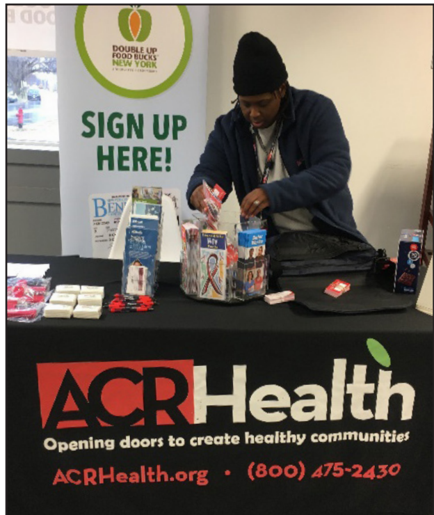
Staffing Tables at Outreach Events