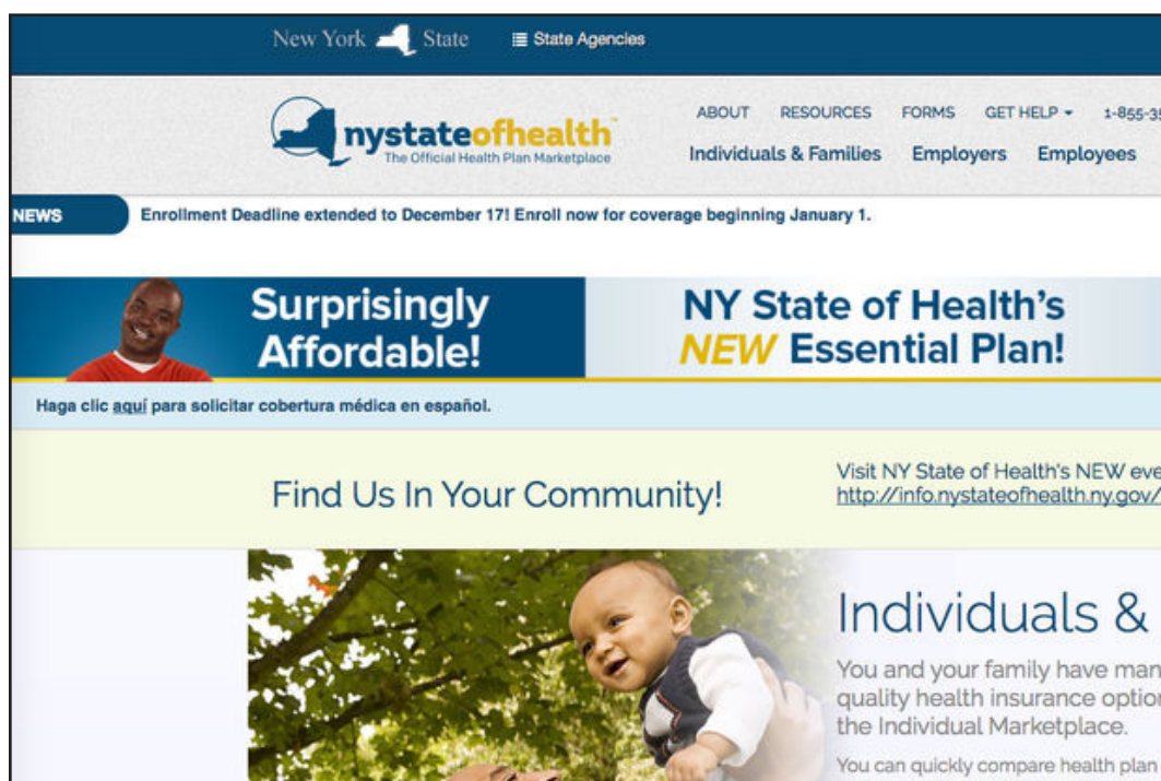
2017 Snapshot of NY State of Health website.

To enroll in insurance through the NYSOH Marketplace website, an uninsured individual enters information about their identity, family composition, income, and insurance status to generate a real-time eligibility determination for the appropriate coverage program and level of financial assistance. Once this eligibility determination is secured, the Marketplace generates a list of available plans so that the consumer can engage in comparison shopping amongst different