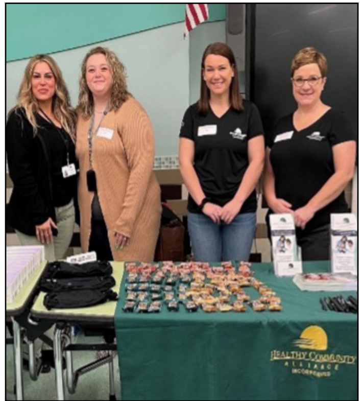
In-person outreach by Healthy Community Alliance.

Providers typically have higher enrollment numbers for two reasons. First, provider venues typically see a high volume of patients on any given day. Second, patients are often motivated to enroll at a provider venue in order to have the care that they received pay for and thus avoid incurring medical bills and unwanted debt. By contrast, Human Services Coalition of Tompkins County (HSCTC) created a training for peer enroller agencies detailing outreach to universities and colleges. This approach engaged a large number of consumers (1.6 million) but resulted in a relatively small number of enrollments of (508 consumers or a .03% yield). These consumers—who were not at the health care venue—may have been less motivated to enroll, or simply already had coverage. Accordingly, yield data can be informative—but is not dispositive—