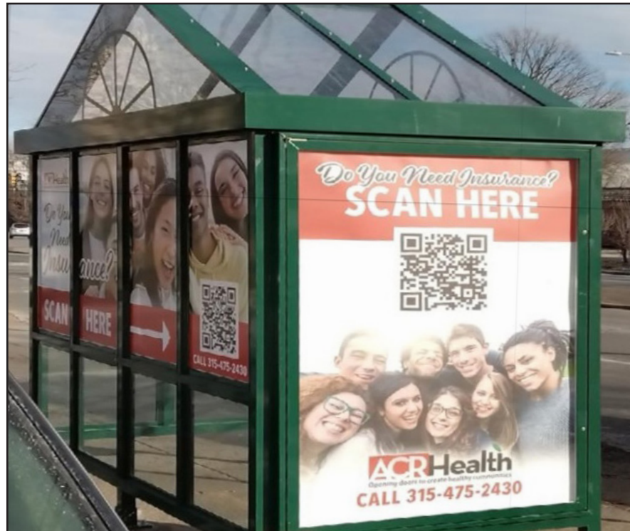
Bus Shelter Advertisement Used by ACR Health