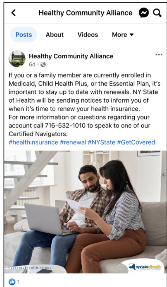
A Facebook Ad Used by Healthy Community Alliance.

Agencies also shared technical innovations in the enrollment space. For example, after one CBO described its use of QR codes on flyers, other agencies quickly moved to incorporate this technique in their materials. Another CBO paid for a web designer to review and upgrade its website, adding a pop-up advertisement that directed visitors to complete a brief intake survey if the visitor was interested in health insurance. CBOs that adopted this strategy reported an uptick in consumers connecting to their organization for enrollment services. A different CBO shared its tactic working with text advertising companies to obtain and use zip-code data to target outreach efforts to areas with higher rates of uninsured individuals.